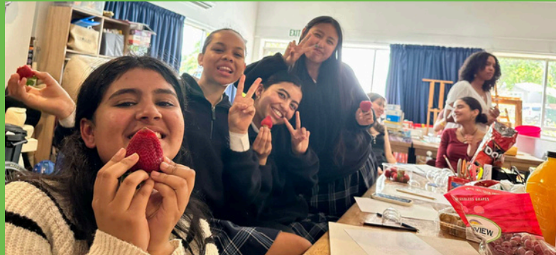
Bhutanese Community Dashain

MYNTies are now working on their amazing project for the “Festival of Christmas Trees” at Nelson Cathedral. You can find the MYNT tree themed “Christmas from around the world” on display from 28 November.