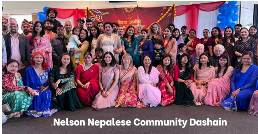
Nelson Nepalese Community Dashain