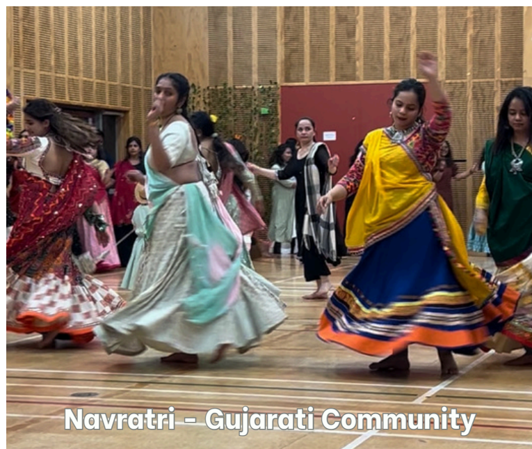
Navratri - Gujarati Community